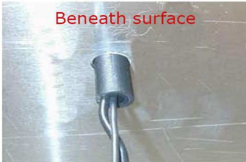
Figure 2: Antenna wires below the surface