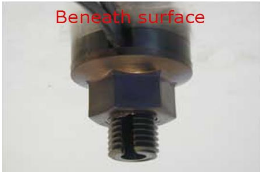
Figure 4: Fastening the bolt to the antenna