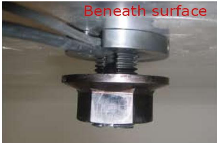
Figure 3: Fastening the bolt to the antenna