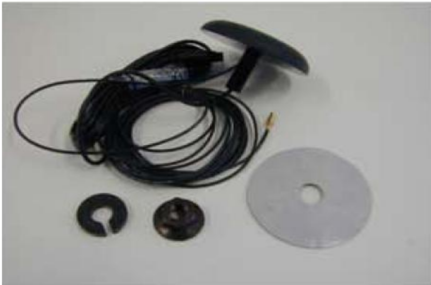
Figure 1: Required components